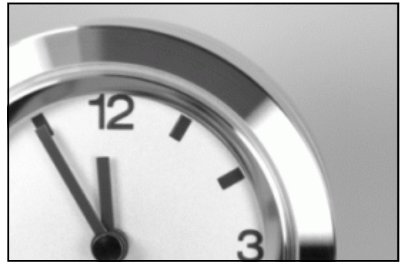
24/7 sales monitoring